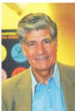
Maurice Levy: keeping an eye on new TV platforms.

PUBLICIS Group chairman Maurice Levy is in Cannes to check out the competition and rally round his troops.